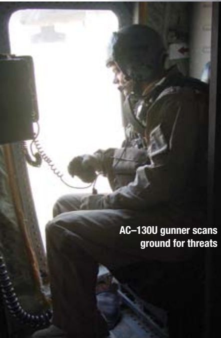
AC-130U gunner scans ground for threats