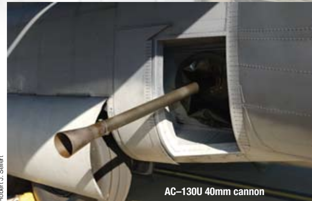
Cockpit of AC-130U

Although a relatively minor setback to the insurgent cause in Iraq, this defeat at the hands of the AC-130 was undoubtedly devastating in the psychological effect of an apparently all-knowing American force able to strike with speed, precision, and minimum